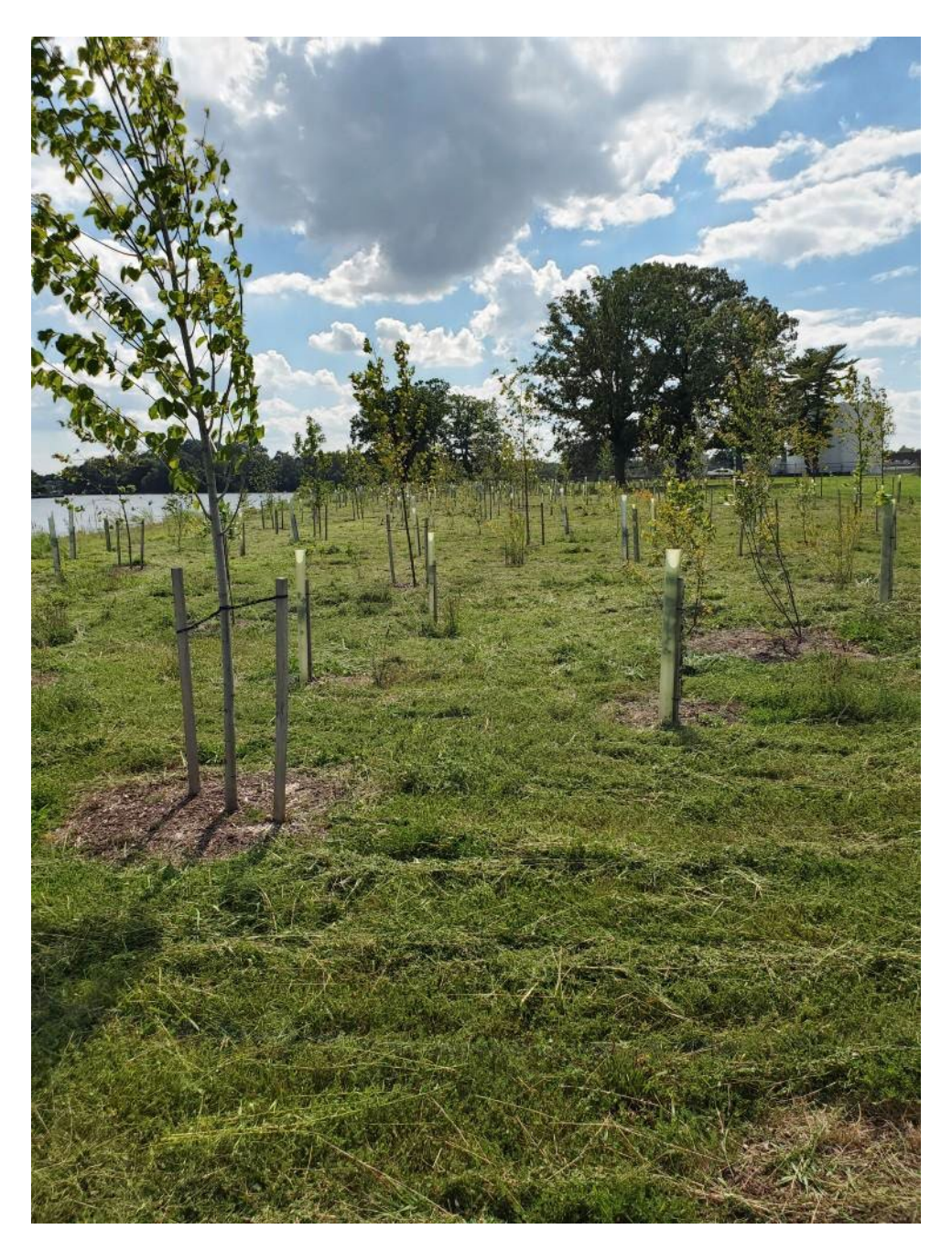
Site Post-Mowing and Before Watering