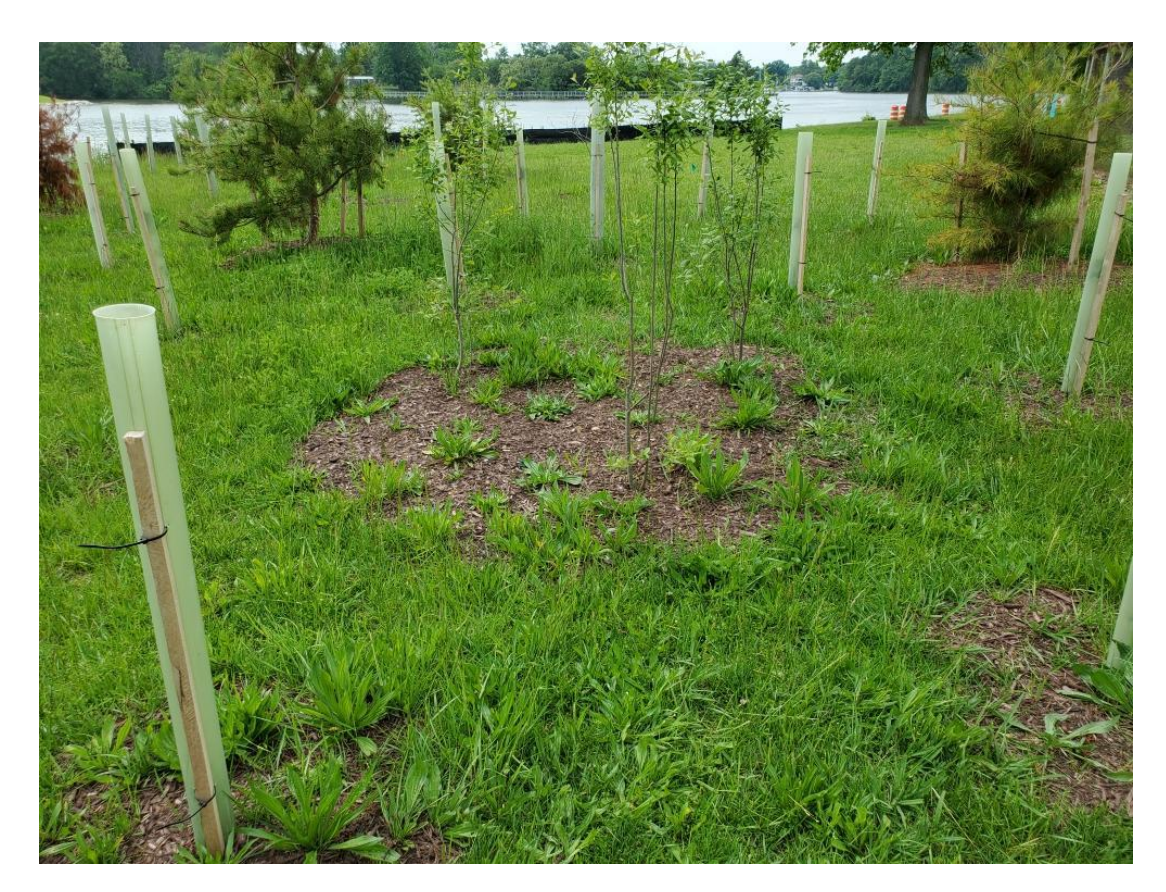
Typical Shrub Cluster Looking Good – Typical Weeds Established in Mulch