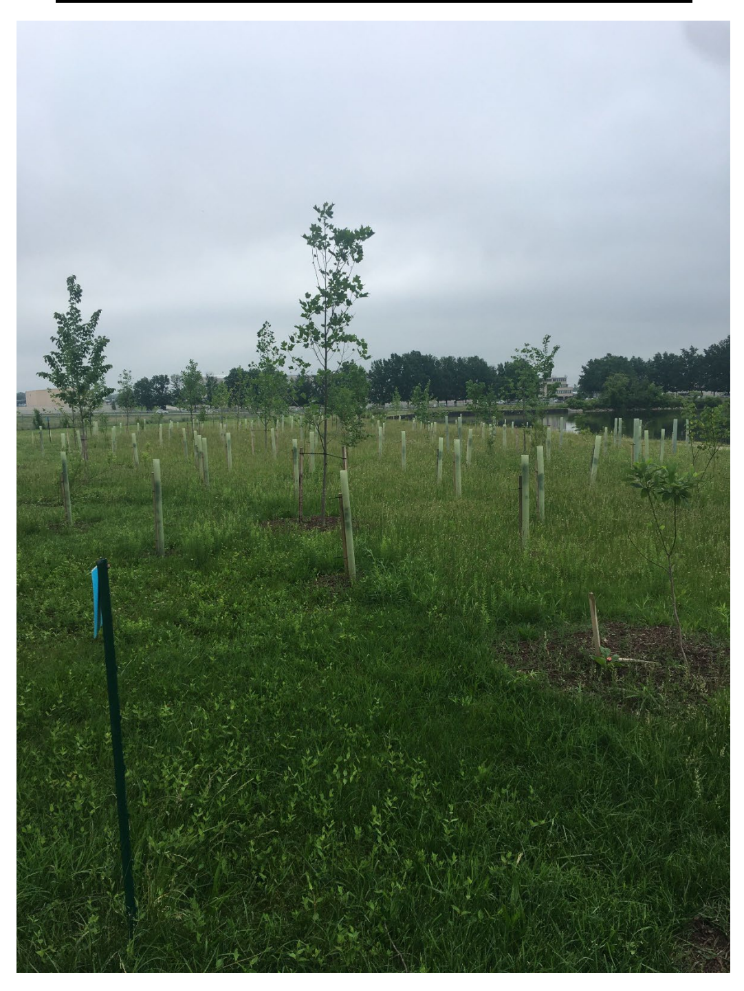
Overall site looking very good.