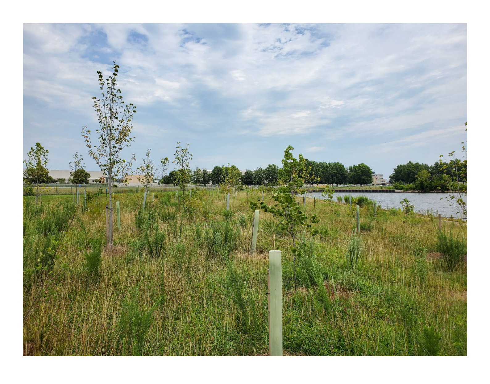
Plants look good but show heat stress despite watering