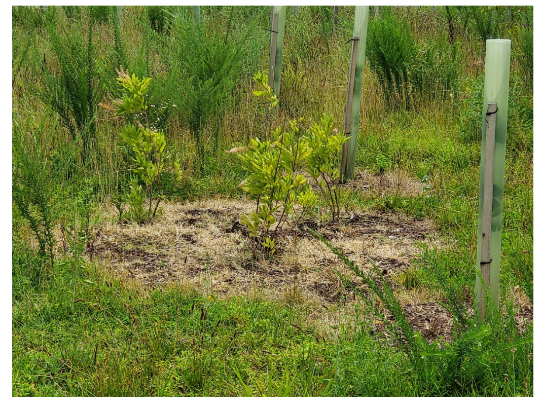
Herbicide treatment around shrubs. Chinese lespedeza establishing.