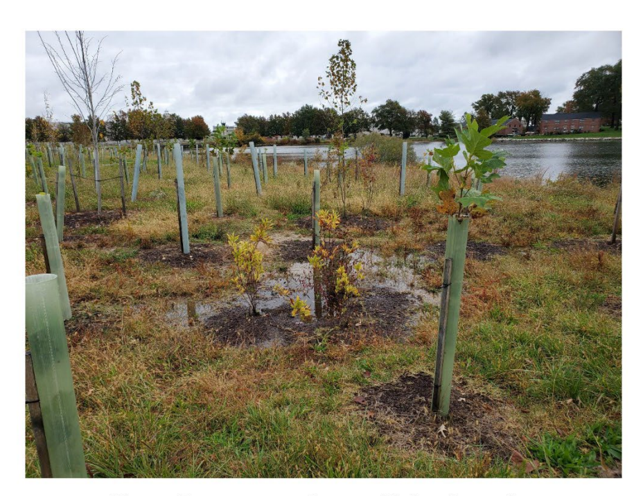
Site soils are more than sufficiently moist.