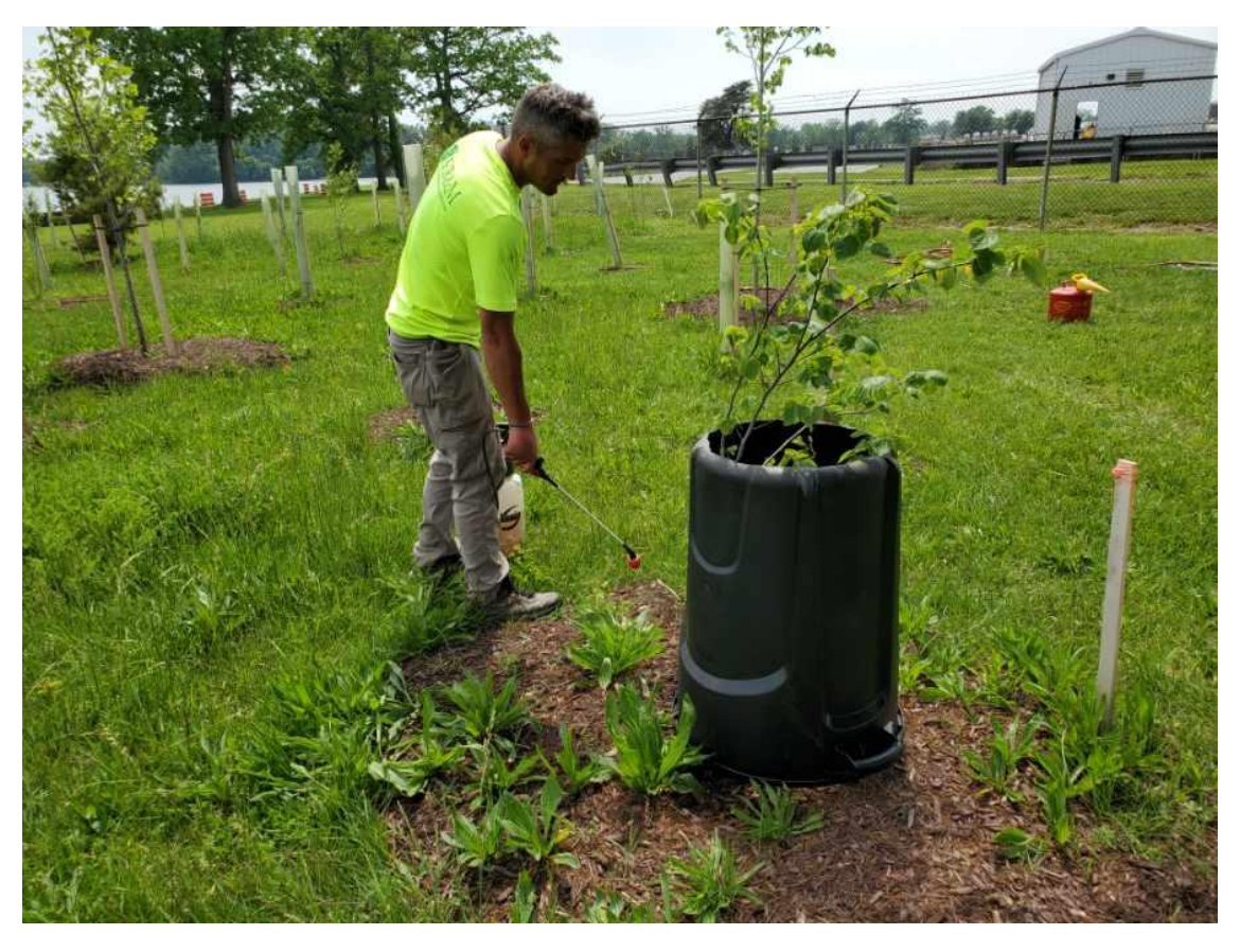
Selective Application of Glyphosate Herbicide of Glyphosate Herbicide to Mulch Beds Illustrated Method of Protecting Small Trees and Shrubs from Herbicide Drift Damage