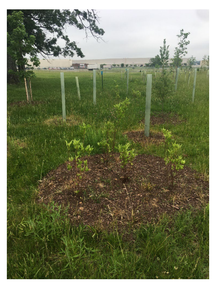
Weeds sprayed in shrub cluster dying off.