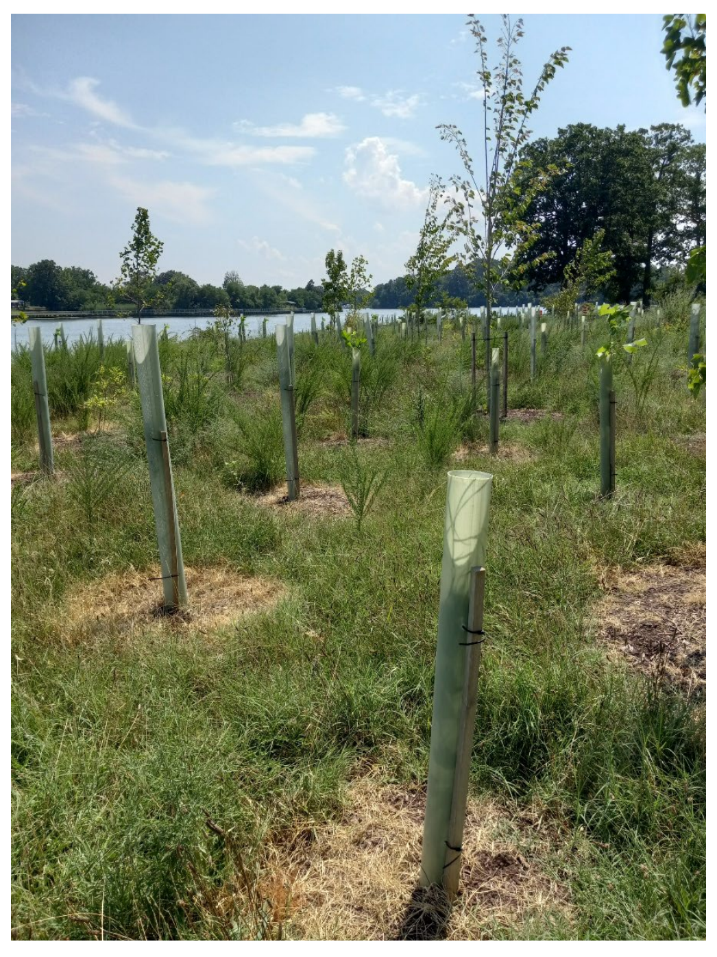
Site prior to mowing

Installed trees and shrubs have rebounded well but regular watering remains necessary due to continuing stretch of dry weather. Chinese lespedeza was mowed, better exposing installed plant material.