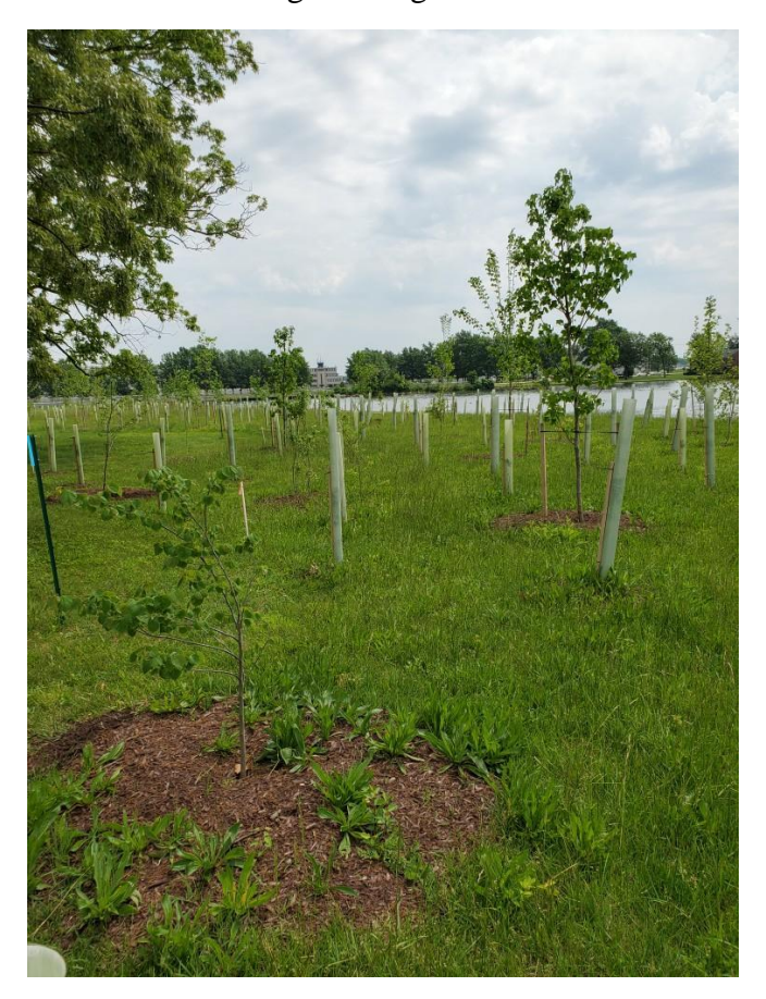
Overview of Site