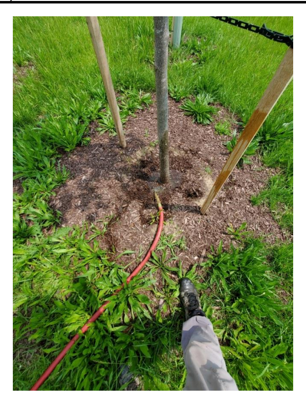
Gentle Watering/Soaking of Tree/Shrub Pits