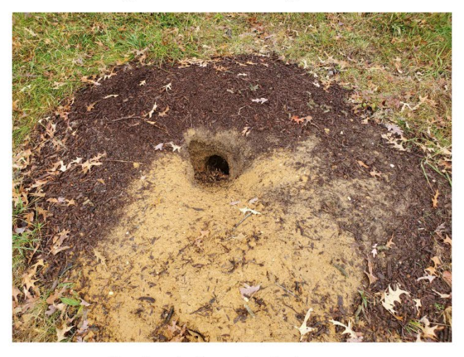
Gopher hole and missing tree