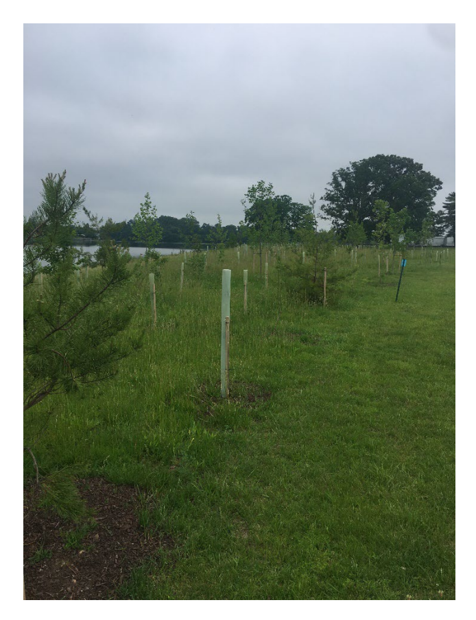
General site overview.