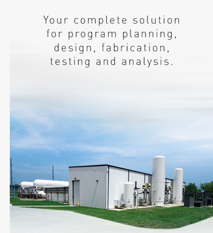
High Speed Wind Tunnel