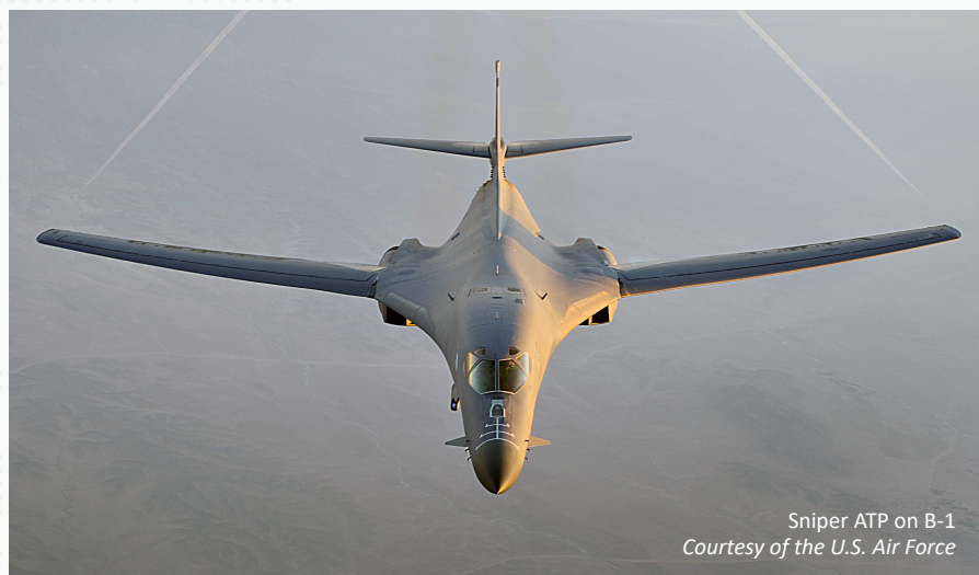
Sniper ATP on B-1